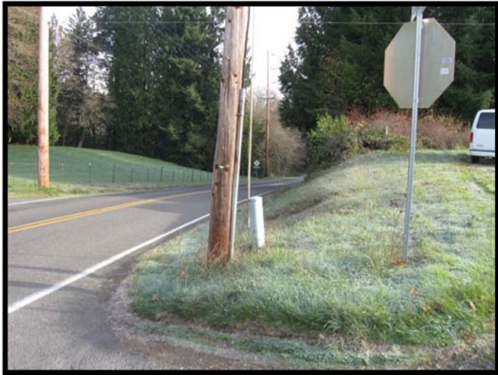
Before – limited sight distance