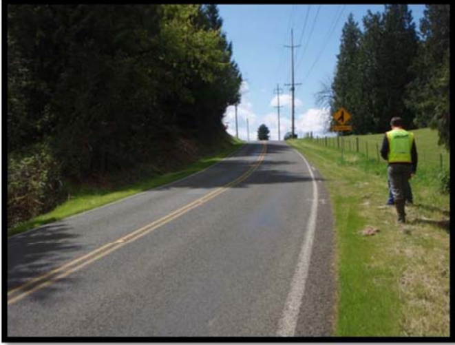
Before – no guardrail