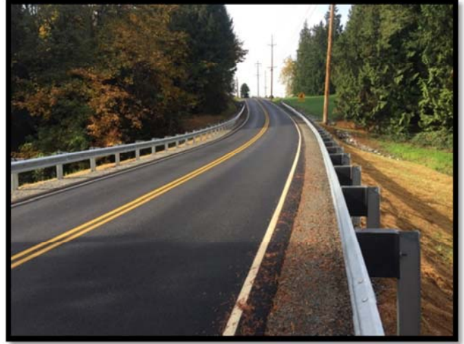
After – guardrail