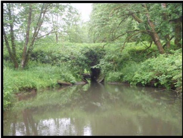
Before – Culvert