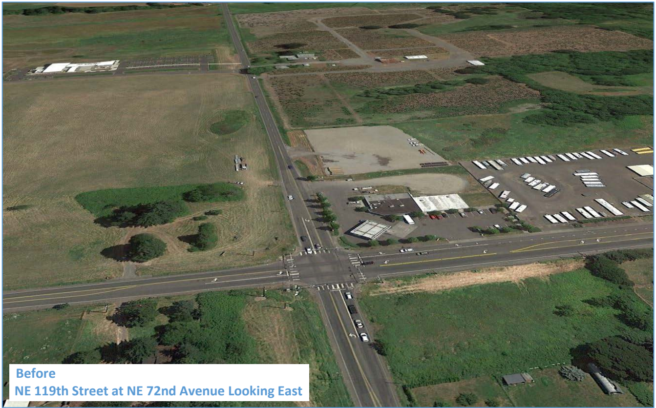
Before NE 119th Street at NE 72nd Avenue Looking East