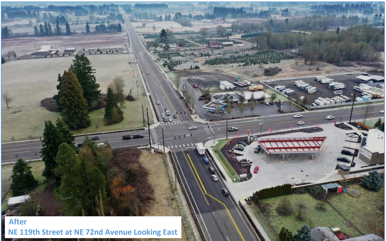
After NE 119th Street at NE 72nd Avenue Looking East